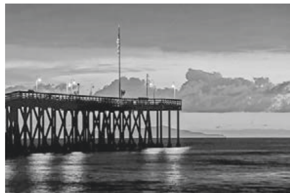
Denise Dewire – First Place

The 3rd annual Pier Photo Contest produced spectacular photographs of the historic Ventura Pier!