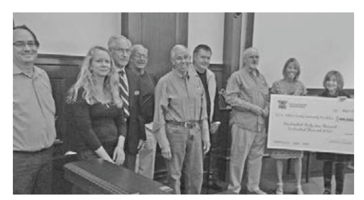
Thanks to the many Pier donors and attendees at Pier under the Stars we were able to make this significant contribution to the Pier Fund.