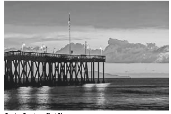
Denise Dewire – First Place

The 3rd annual Pier Photo Contest produced spectacular photographs of the historic Ventura Pier!